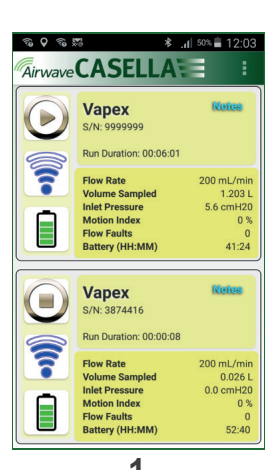
Find your VAPex on Airwave