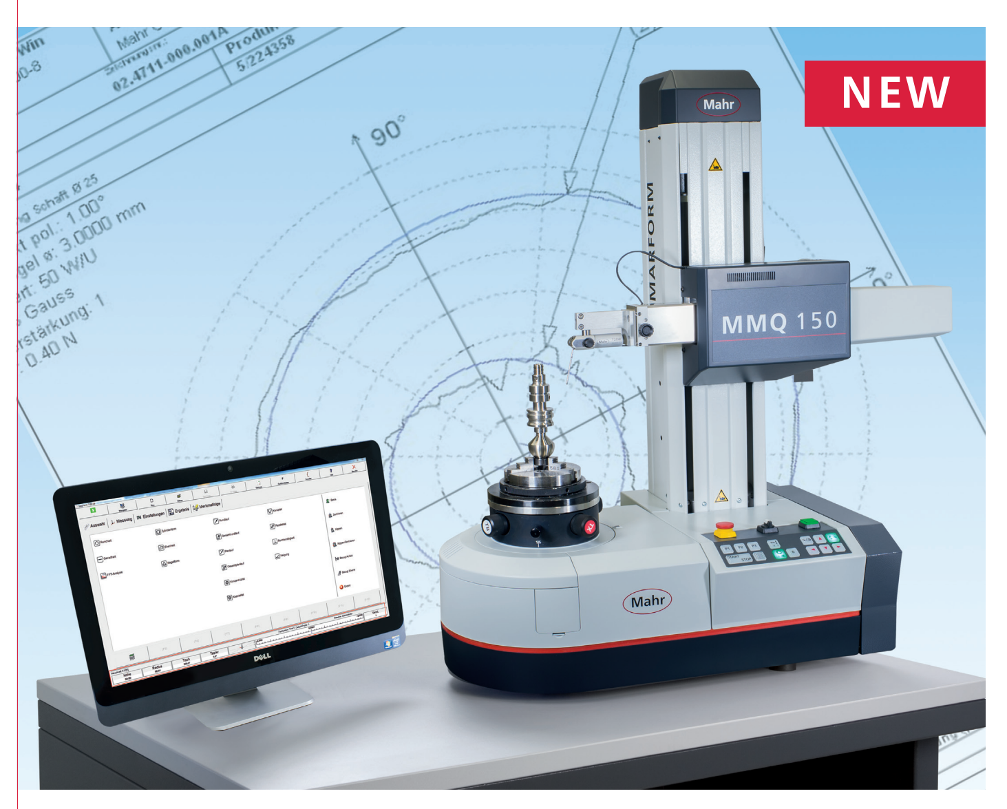
MarForm MMQ 150 Cylindricity